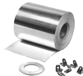
K67 Ground Plane Kit